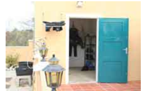
external storage for diving equipment

Booking information: Ocean Adventures NV Kaya Kuarts 10 Santa Barbara Bonaire Netherlands Antilles Tel.: 00599-717-2278 mailto://villa@oceanadventures.com